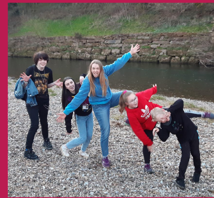
^ Clubs and Activities

To find out more on all these visit www.oakleatrust.co.uk