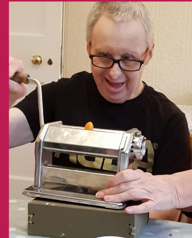
^ Family Support