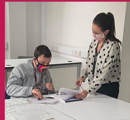
^ Job Search and Learning

“The support I have been given has helped me get where I am now.”