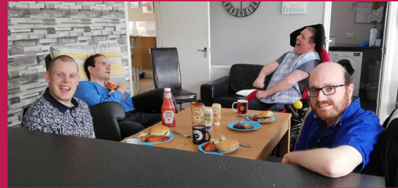
^ Supported Living