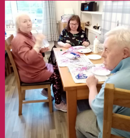
^ Care Homes