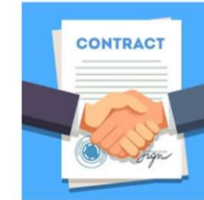
Contract and Lease Review/Database