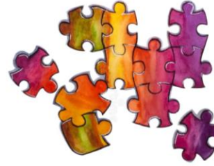
Roles, responsibilities and accountabilities

In addition to the above, long-term ambitions, the Board and the Senior Team have identified the six areas to the right as the key areas of operational priority for the coming year.