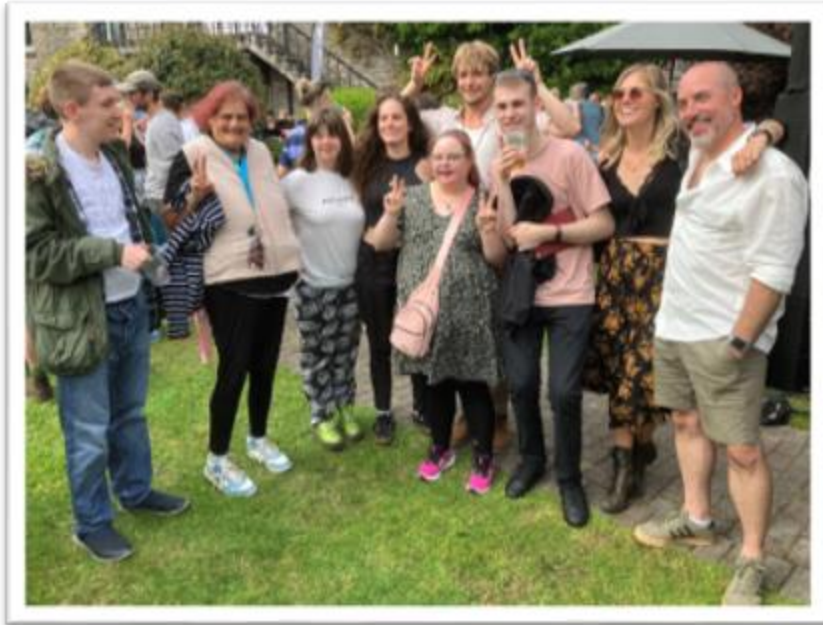
Above: Customers, Learners and Team Members from across the Oaklea Group