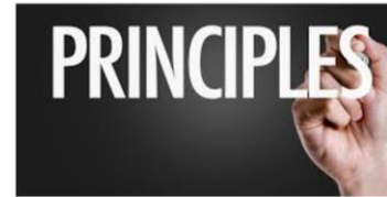
Clear remuneration principles