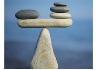
Stability, culture, morale