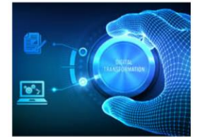
Planning for Digital Transformation