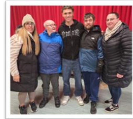
Left: Staff and Customers from Foundry Street meet a star of Emmerdale...