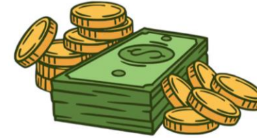
Income generation and diversification