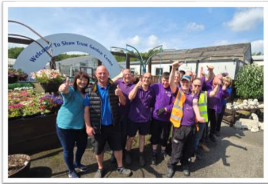
Above: Customers and staff team with our partners, the Shaw Trust CiC